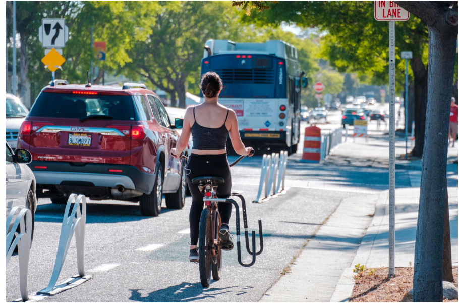
Pop-up bike lanes on Portola Drive, Santa Cruz