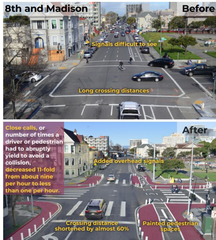
Quick-Build Project in Oakland