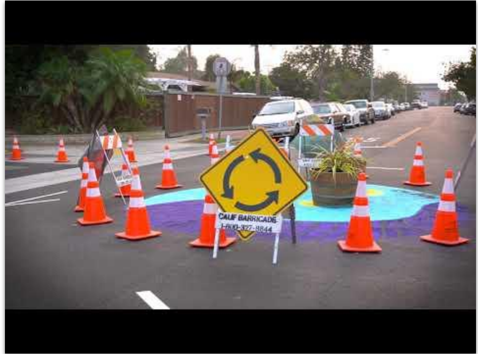
Temporary roundabout and bulbouts in Costa Mesa https://youtu.be/RrrNvy_Olj8