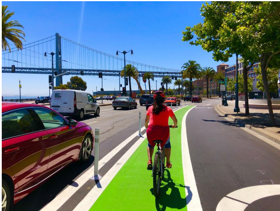
Quick-Build Project in San Francisco