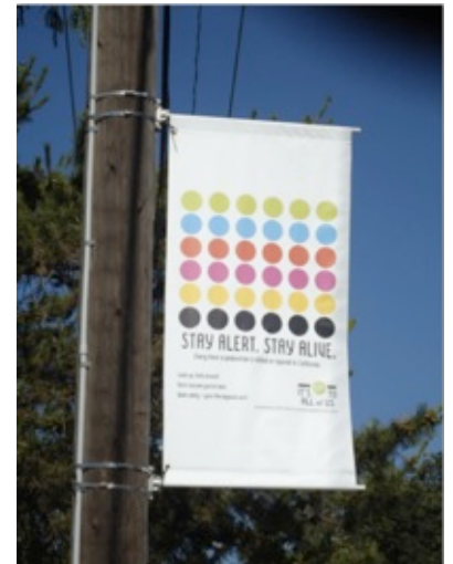
EXAMPLE IMPLEMENTATION OF IT'S UP TO ALL OF US BANNER