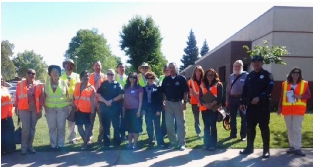
WORKSHOP PARTICIPANTS PREPARING TO HEAD OUT FOR WALKABILITY ASSESSMENT