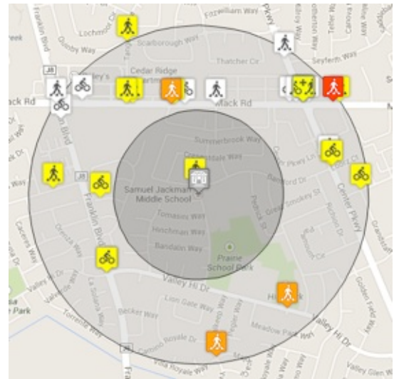
2009-2011 PEDESTRIAN AND BICYCLIST COLLISION HISTORY WITHIN 1/4 AND 1/2 MILE OF SAMUEL JACKMAN MIDDLE SCHOOL

Over a three-year period (2009-2011), there have been a total of 24 pedestrian and bicyclist collisions within a half-mile of Samuel Jackman Middle School, including a pedestrian fatality near the intersection of Mack Road and Center Parkway. More recently in November 2013, a Samuel Jackman student was hit and injured while crossing Valley Hi Drive in a marked crosswalk and a 17-year old student at nearby Rio Cazadero High School was killed crossing Mack Road at Summersdale Way in an unmarked crosswalk.