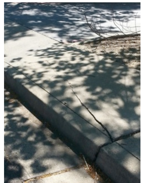
CRACKED SIDEWALK AT SOUTHWEST CORNER OF BAMFORD DRIVE AND SCHOOL DRIVEWAY