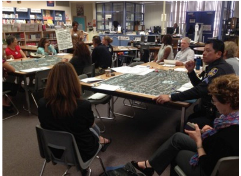
PARTICIPANTS SHARING RECOMMENDATIONS DEVELOPED IN SMALL GROUPS