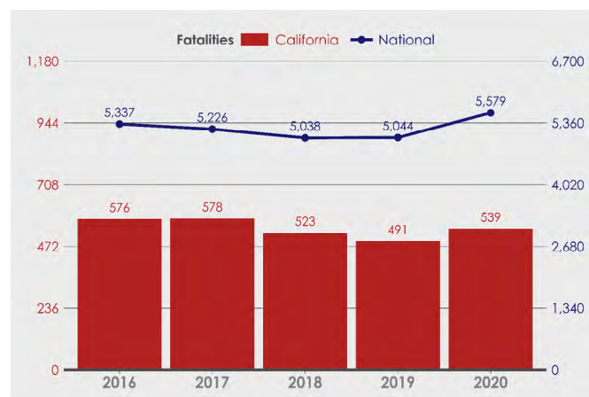
Figure 1: Motorcycle Fatality Trends, Nationwide and California, 2016-2020