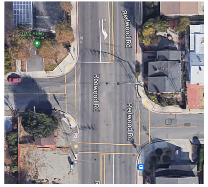
Figure 1. Redwood Road and Mabel Avenue