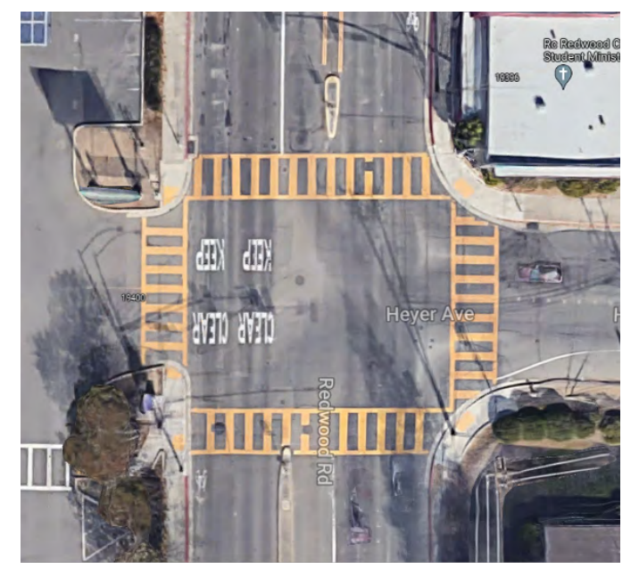
Figure 2. Redwood Road and Heyer Avenue