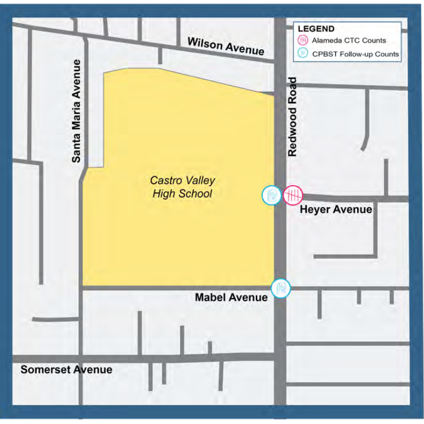
Figure 3. Count locations