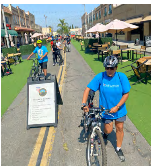
Youth walking their bikes through the parklet.

The Project Team hosted a virtual training on Friday, June 18, 2021, to educate youth on bike infrastructure that can improve road safety and community programs to strengthen the youth bike club. Bike infrastructure included different types of bike lanes, bike sensors, bike boxes, biking parking, and bike repair stations. After the training, participants shared they have a better understanding of how to safely use these biking facilities after the training. For example, participants learned to safely get off and walk their bikes through the parklet in Old Town Placentia during the group ride. Community programs were also shared to encourage youth to collaborate with the City of Placentia and local community partners in their bike club activities. Programs included bike rodeos, community bike rides, how to select a bike route, participatory campaigns, earn-a-bike programs, photo and video voice, and other programs.