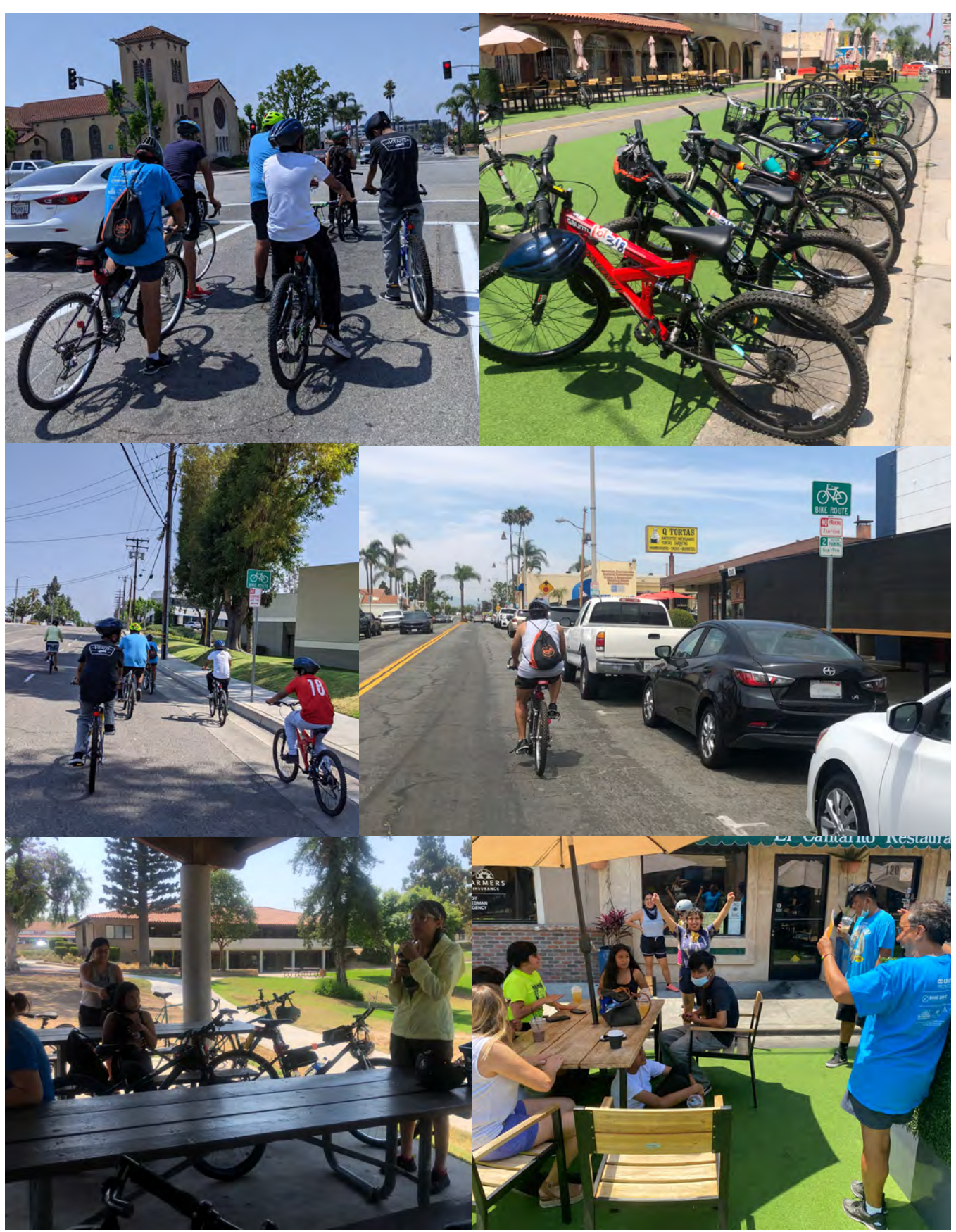
<u>TOP LEFT</u>: Youth riding to old town Placentia, at the Bradford Avenue/Chapman Avenue intersection. <u>TOP RIGHT</u>: The Parklet on Santa Fe Avenue with participants' bicycles. <u>CENTER LEFT</u>: LOT318 youth riding on South Melrose Street towards Kramer Park. <u>CENTER RIGHT</u>: LOT318 Executive Director assessing Bradford Avenue where there is a bike route. <u>BOTTOM LEFT</u>: The shaded picnic table area at Kramer Park. <u>BOTTOM RIGHT</u>: The presentation of TikTok videos.