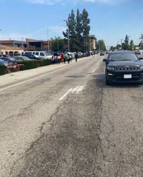
<u>BOTTOM LEFT</u>: Cal Walks Staff passes the only observed bike route signage traveling north on South Melrose Street. <u>BOTTOM RIGHT</u>: Cracked uneven pavement on South Melrose Street in front of Whitten Community Center, during Melrose Elementary School's dismissal time.